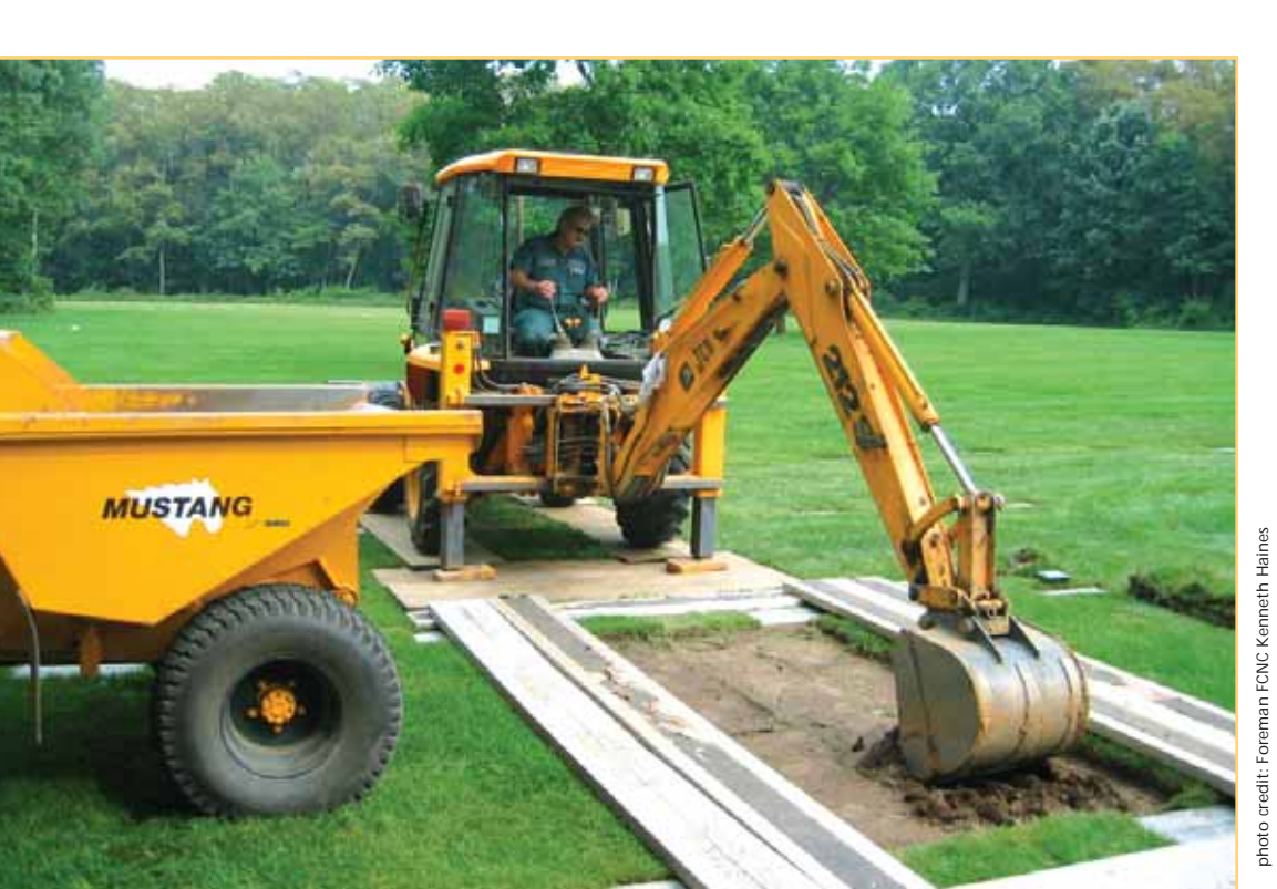
One of the many jobs that must be done at a National Cemetery, of course, is preparing gravesites. Here backhoe operator Charlie Martin opens a grave using equipment running on biobased transdraulic oil and B20 biodiesel.

"All of the products we've used have worked as well or better—than their non-biobased counterparts, and the equipment they are used in (or on) is performing normally," reports Trittschuh. "In fact, some of our 90-some pieces of equipment use more than one biobased product. Our backhoe operators have noticed that sticks used to maneuver hydraulic equipment feel tighter and smoother operating. They also say that the hydrostatic transmissions are working the same with biobased fluid as they did before and that operators have not reported any negative characteristics. In addition, operators have mentioned that engine performance is smoother with better idling and a small reduction in soot. The two-cycle engines, chainsaw bars and sprockets—all are performing well."