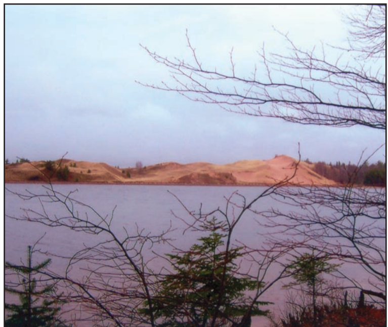
Pictured Rocks National Lakeshore’s environment benefits from the use of biobased products.

“Once we got started, we looked for as many products as possible and realized that the program to use environmentally friendly biobased products went very well with our continuing safety program, which was aimed both at park workers and park visitors,” he notes.