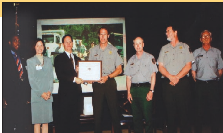
Pictured Rocks National Lakeshore staff received the prestigious White House Closing Circle award in 2002 for their many environmental efforts, including use of biobased products.

"We loaned him a gallon of parts cleaner, and later he reported it worked wonderfully. The locks could be cleaned with inmates in the cells without any adverse affect on them or the people doing the cleaning. They tell me: